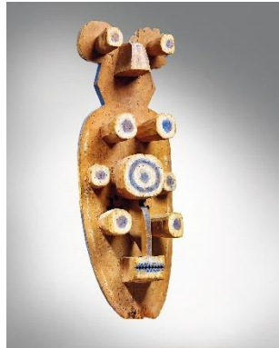
A GREBO/ KRU MASK LIBERIA

Height: 26 in. (66 cm.) ESTIMATE: USD 300,000 – USD 500,000