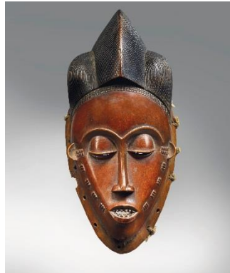
A GURO MASK REPRESENTING GU IVORY COAST

Height: 27 ¼ in. (70.5 cm.) ESTIMATE: USD 200,000 – USD 300,000