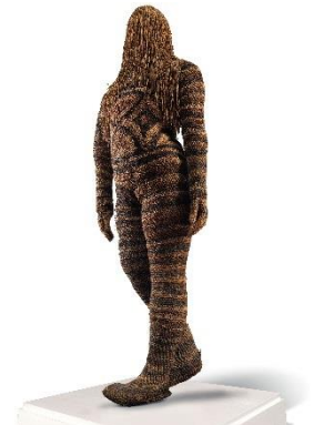
A CHOKWE ENSEMBLE ANGOLA

Height: 10 ½ in. (27 cm.) ESTIMATE: USD 180,000 – USD 250,000