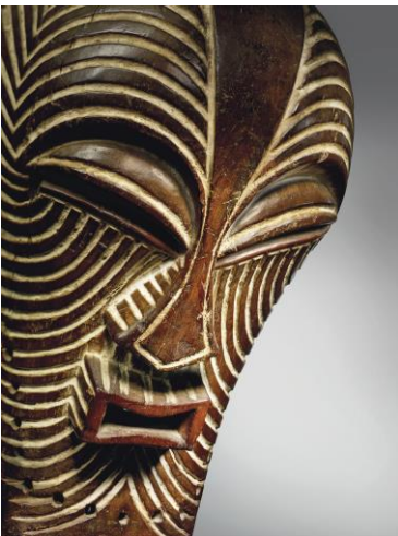
THE WALSCHOT-SCHOFFEL KIFWEBE MASK ATTRIBUTED TO A SONGYE MASTER ARTIST DEMOCRATIC REPUBLIC OF THE CONGO Height: 14 8/5 in. (37 cm.) ESTIMATE ON REQUEST

A celebration of female strength, fertility, and beauty, this sale offers works of art that showcase the powerful influence of women in 19 th century African culture. The works once performed important functions surrounding universal themes of social unity, protection, fertility of the land and by natural extension the people. A unique and diverse compilation of figures and masks featuring rare artistry from West and Central Africa. The nine masterworks carry old and distinguished provenances, which is further enhanced by their exhibition histories and published literature.