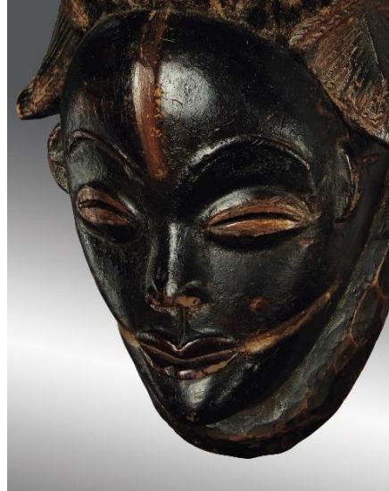
A BLACKENED PUNU MASK, IKWARA GABON Height: 12 in. (30.5 cm.) Estimate: USD 250,000 – USD 350,000

New York – Christie's is pleased to announce the Art of Africa Masterworks sale, which will take place on May 14, 2019 in New York. The auction is an exceptional sale featuring nine masterworks of African Art and will coincide with Christie's 20 th Century Week sales .