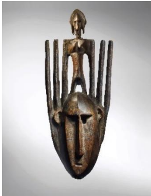
A BAMANA NTOMO MASK ATTRIBUTED TO THE PROTO - SÉGOU MASTER MALI

Height: 26 in. (66 cm.) ESTIMATE: USD 300,000 – USD 500,000